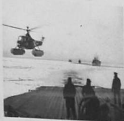
THE NEW YORK PUBLIC LIBRARY ASTOR LENOX TILDEN FOUNDATION 155 E. 42ND ST. NEW YORK 17, N.Y.