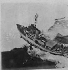
THE NEW YORK PUBLIC LIBRARY ASTOR LENOX TILDEN FOUNDATION 155 E. 42ND STREET NEW YORK 17, N.Y.