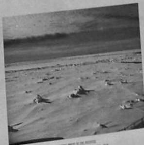
THESE ARE THE RESULTS OF THE RESEARCH