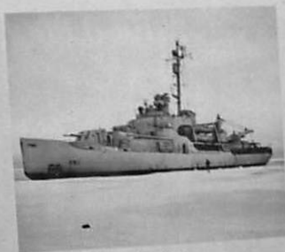
TO THE STATE OF NEW YORK IN SENATE JANUARY 11, 1911. REPORT OF THE COMMISSIONERS OF THE LAND OFFICE IN ANSWER TO A RESOLUTION PASSED BY THE SENATE MAY 1, 1909. ALBANY: J. B. LEECH, STATE PRINTER. 1911.